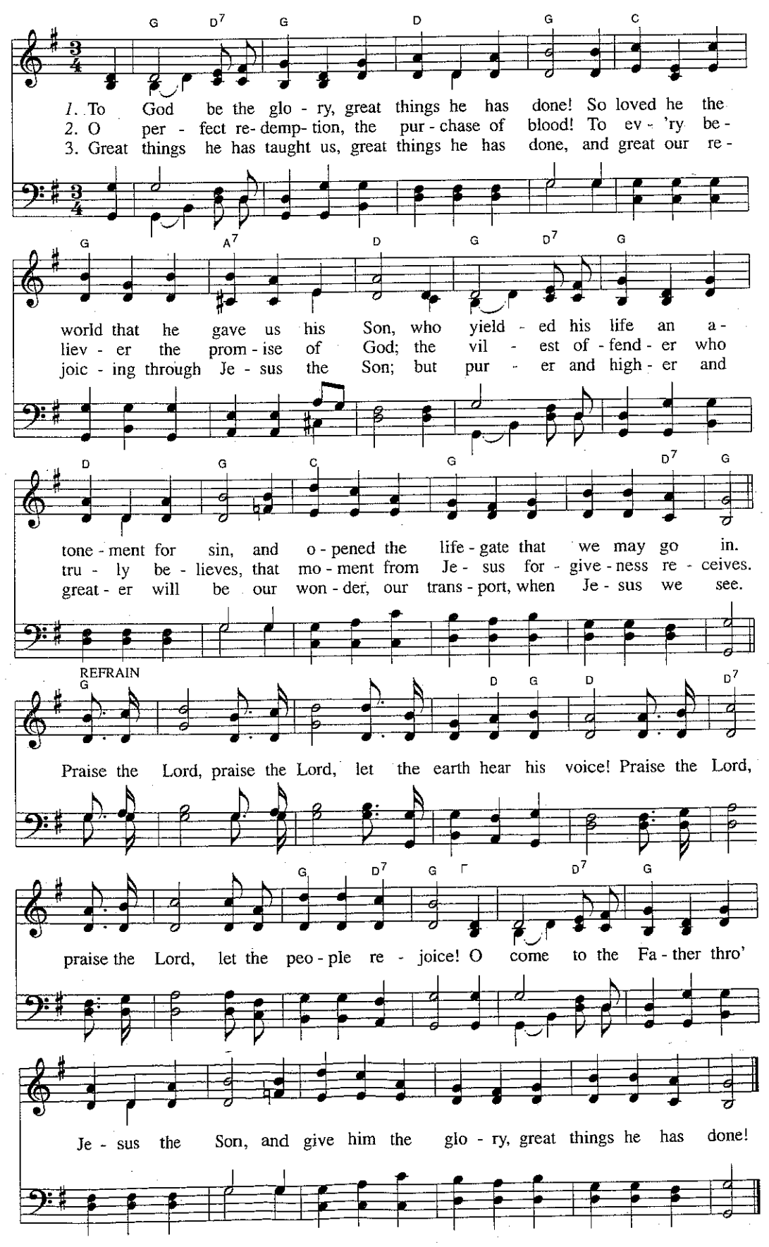
All the people were praising God for what had happened. Acts 4:21